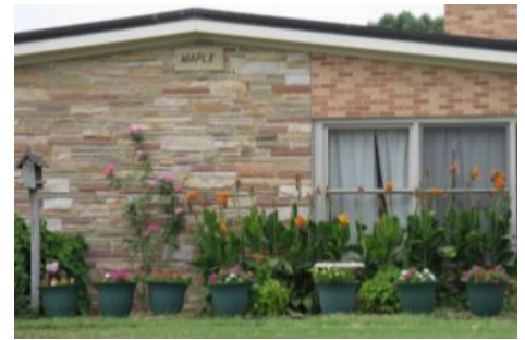
Maple's Garden Beginnings

Maple has also started to brighten their cottage with container flowers! Marvin has been busy in the evenings keeping up with the watering and weeding.